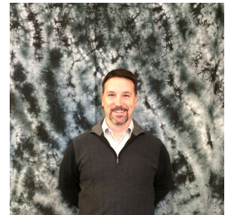
Director of Studies